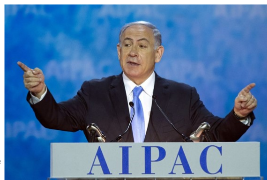
Prime Minister "Bi-Bi" Netanyahu getting the crowd excited

The lobbying overall was considered to be a success due to the number of congressmen that will support the agenda. Now AIPAC will begin to develop a new agenda for next year to ensure the strong relationship between Israel and the United States.