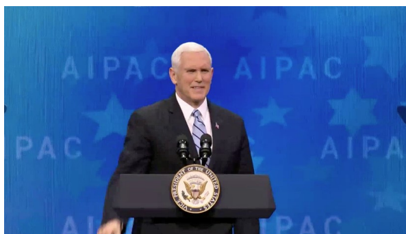
Vice President Mike Pence speaking

In the beginning of the first two days, there is a general session where everyone sits and listens to various speakers. These speeches are primarily meant to educate the crowd and set the tone for the day. Some speakers included, Ambassador Ron Dermer, Russian civil rights leader Natan Sharansky, and many congressmen. Then throughout the day there are many "breakout sessions" where people go into smaller groups to learn specific topics of their choosing. Then finally at night, there is an evening general session. At these evening sessions there are more speakers but they are typically more notable. Some examples include, the President of Guatemala, Ambassador Nikki Haley, Nancy Pelosi, and Vice President Mike Pence. Finally on the last day, there is one general session in the morning followed by a trip to the Hill in order to lobby the focal points of AIPAC's agenda. The morning included speeches of the U.S. Ambassador to Israel David Friedman, Marco Rubio, Steve Scalise, Mitch McConnell, and Prime Minister Benjamin Netanyahu.