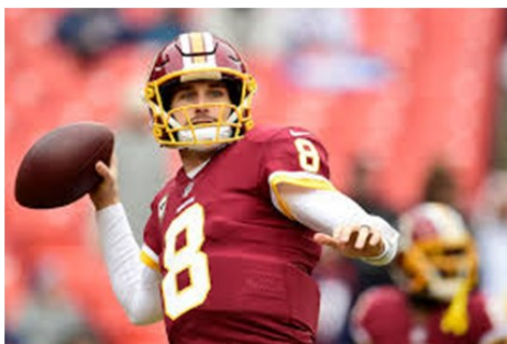
Kirk Cousins is one of the biggest free agents this offseason.

Bortles' performance in the playoffs is the main factor that makes the Jags offseason critical for them. Bortles is guaranteed up to $35 million, which only gives the Jaguars $17.5 million in free agency, so they need to make the decision to either keep Bortles or drop him to be able to sign Cousins. Cousins' was also presented with other offers for much more money with less of a chance at a Super Bowl.