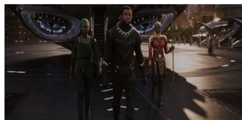
A Wakandan space shuttle. One of the many advanced technical inventions in the film

While the $1 million pledged by Disney will make a huge impact on the kids benefitting from the programs, that amount is merely a fraction of the money that the film brought in. "Black Panther" earned more than $700 million worldwide in less than two weeks of its release, making it one of the fastest grossing films ever! Along with representation, the message of possibilities was a key factor in the film's success and hopefully with the $1 million pledged, the youth of the impacted STEM programs will be on their first step to building a Wakanda of their own.