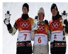
Olympic gold medalist.