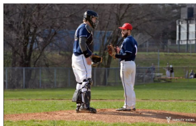
Mound visit during a sunny home game at Franklin High school

Knowing that the team has been struggling the past few years, the baseball team has decided to move down a division this season hoping that the team's record will improve significantly. Although the team did move down a division, it will be harder for them to win games this season because they have lost several seniors from last season, but the team will find a way.