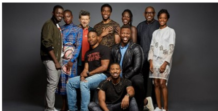
Some cast members from Black Panther

The long anticipated Marvel's "Black Panther" opened box offices for its premiere on Thursday, February 15 th . The action-packed super hero movie's ticket sales leaped to $25.2 million in its first day. "Black Panther" has a star studded cast, and fans have been waiting nearly two years since its announcement in 2016. For the first black super hero to get their own film, Marvel addressed a Hollywood misconception about the racial divide on display to the rest of the world.