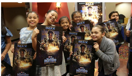
Long Beach, Ca. members of the Boys and Girls Club at an advanced screening on Feb. 15, 2018

Following its record-breaking box office success, Marvel's "Black Panther" is giving back some of its great fortune to youth STEM programs around the country. Disney CEO Bob Iger shared that it was "thrilling to see how inspired young audiences were by the spectacular technology in the film, so it's fitting that we show our appreciation by helping advance STEM programs for youth, especially in underserved areas of the country, to give them the knowledge and tools to build the future they want."