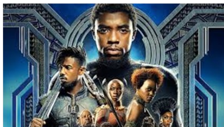
The King of Wakanda (Chadwick Boseman)

Aside from the star studded soundtrack, Marvel packed "Black Panther" with an outstanding cast including Chadwick Boseman, Michael B. Jordan, Lupita Nyong'o, Forest Whitaker, Martin Freeman, and many more. The subject of controversy will be if it is nominated for any Academy Awards, as the awards themselves have been predominately homogeneously white for the majority of their existence. "Black Panther's" cast is predominantly African American including Director Ryan Coogler. Besides best score, special effects, and possibly original song, it is hard to picture "Black Panther" winning other awards when it's up against other films in 2018 like "Deadpool 2", "The Incredibles 2", "Solo: A Star Wars Story", "Ready Player One", and many other anticipated films.