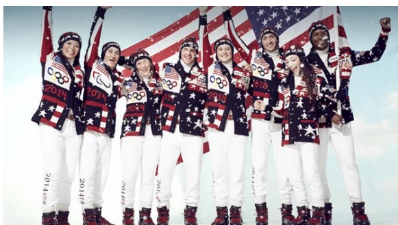
Team USA's Opening Ceremonies uniform