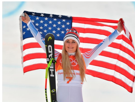
Lindsey Vonn Celebrating her third place finish.

The medal made her the oldest women alpine skier to win a medal at the Olympics.