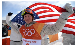
Red Gerard representing the United States holding the flag after he won gold.