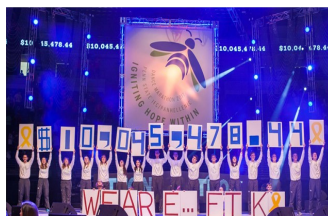
Students announcing the amount of money made in front of school.

The main reason that THON is the biggest student run fundraiser is the insane amount of money they have been able to raise each year. This year they were able to raise over $10 million, all of which will go to pediatric cancer research. The crazy thing about it is this is not even the largest amount of money they have been able to obtain. In 2014, they raised just over $13 million, the most by any university cancer fundraiser ever, and since 1973, they have raised a total of about $150 million.