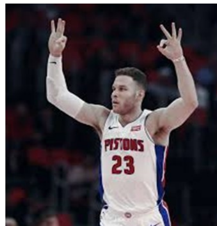
Blake Griffin celebrating a made shot in his new Pistons jersey.

Another big way for teams to acquire bench talent and depth after the trade deadline is buyout season. This is the term applied to when players have their contracts bought out by the team he is on in order to sign a small contract for the remainder of the season with another team. The team that has used this most to their advantage this season is the Houston Rockets who acquired Joe Johnson, a 6'7 forward, and 7 time all-star. The Rockets are trying to dethrone the reigning NBA champion Golden State Warriors behind MVP favorite James Harden. All in all, this trade deadline was far more exciting than most anticipated and will certainly be looked back on as one that had a huge impact on the league and this year's title contenders. Only time will tell if the teams made the necessary changes to beat what is considered one of the greatest teams of all time, the Golden State Warriors.