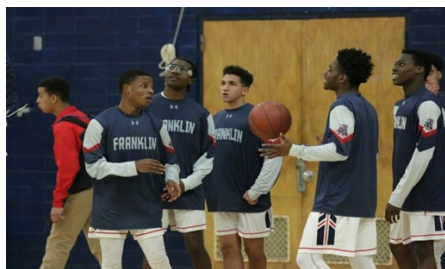
The Varsity Team during warm ups