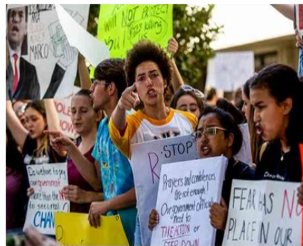
Students shown protesting a need for change on gun laws after school shooting in Florida that left 17 dead.

the shooting. The April 20 walkout will be to remember and fight for change on the anniversary of the Columbine shooting, in which thirteen people were killed. There is a march on Washington called "A March for Our Lives" which is student led and will protest for stricter gun laws. This march will take place on March 24 in Washington D.C. There is no specified time yet. There is also a town hall meeting for Franklin High School on March 14, from 6-8 P.M. in the library. This town hall meeting will allow students, teachers, parents and staff to ask questions, state problems and concerns, and discuss possible solutions surrounding our school safety. The more people that attend, the more productive the meeting will be, having as many people as possible to express their beliefs and ideas for school safety.